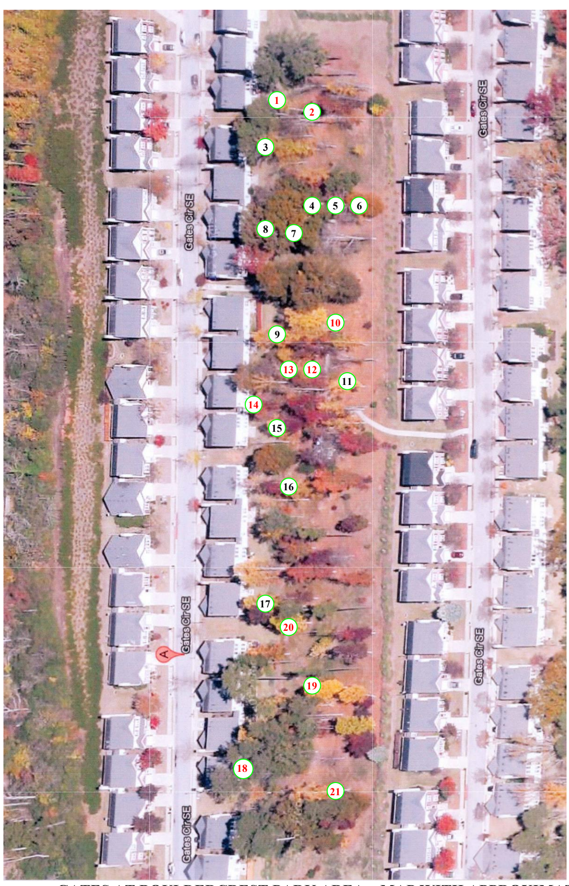
GATES AT BOULDERCREST PARK AREA – MAP WITH APPROXIMATE LOCATION OF DEFECTIVE TREES (September 2014) – TREES WITH RED NUMBERS HAVE BEEN REMOVED