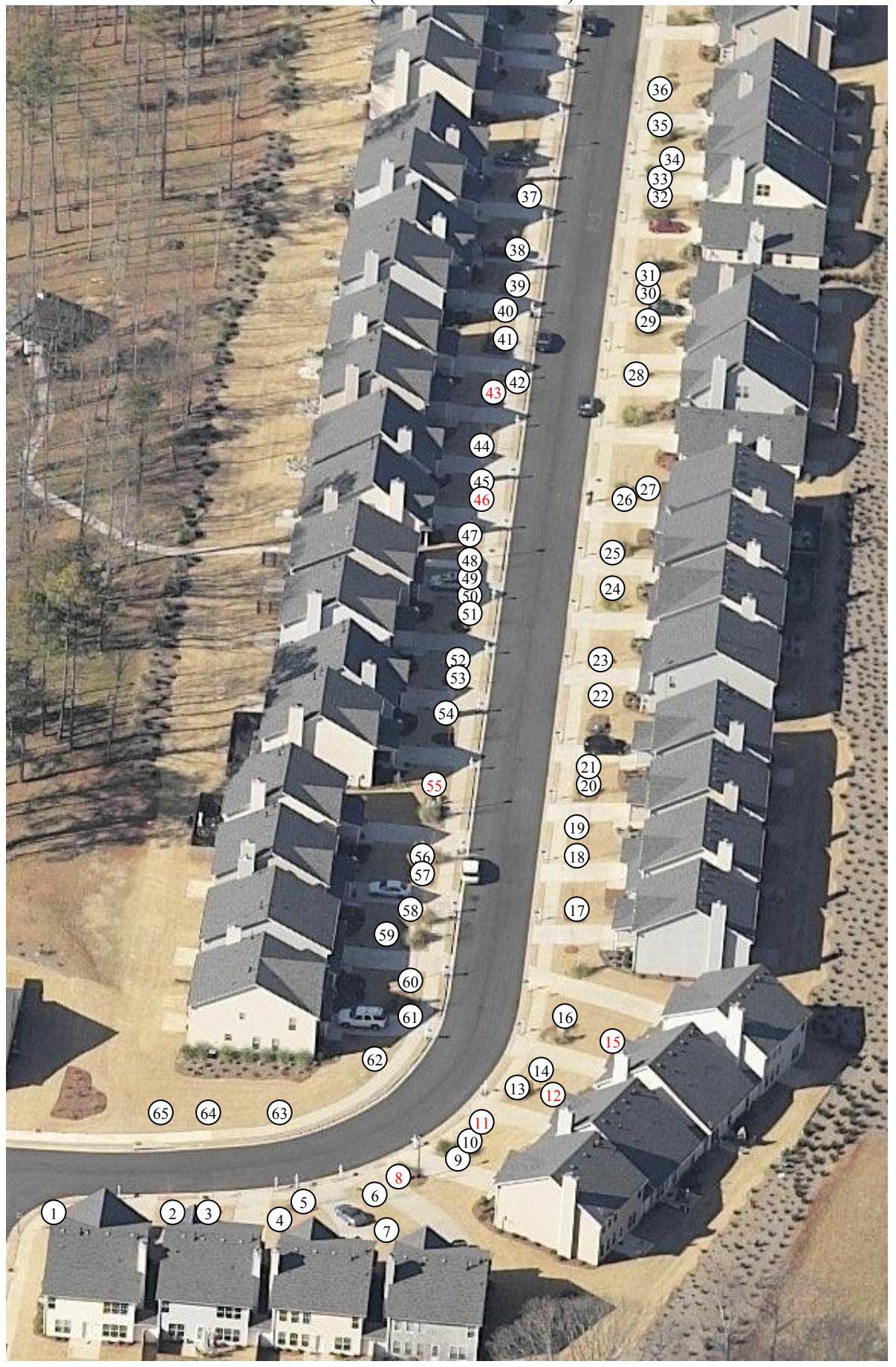
Scale – 1 inch equals approximately 60 feet.