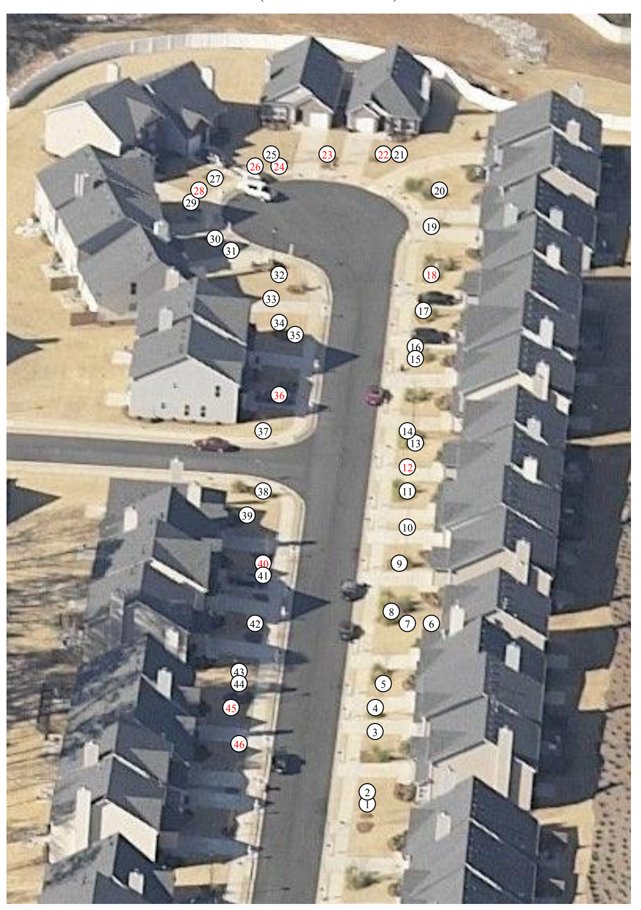
Scale - 1 inch equals approximately 40 feet. Trees with red numbers have been removed.